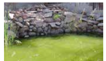
All the benefits of barley straw without the mess!

water all year round. Aquatic Barley Straw Extract instantly gives results letting you enjoy the benefits of natural barley straw. No need to wait when you are using Aquatic Barley Straw Extract, it will naturally improve water purity. Perfectly safe to use around fish, plants and people.